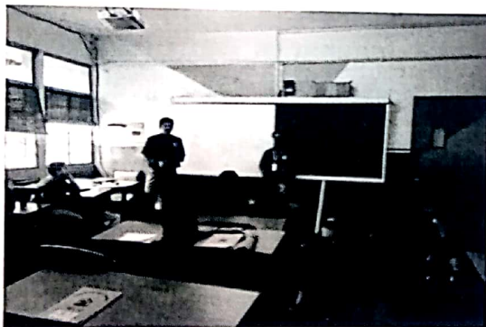
Peer education sessions by peer educators.