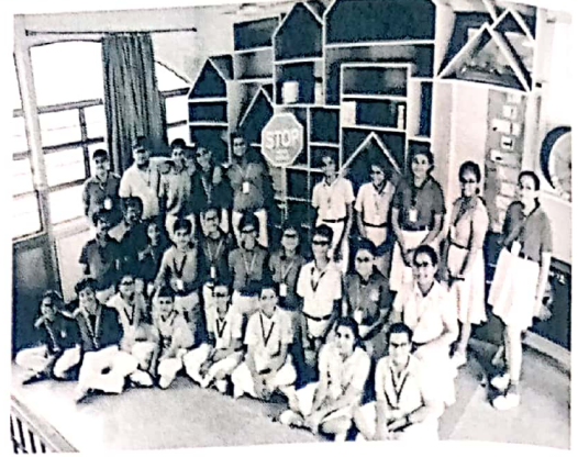
Stop and smile banners to promote mental health