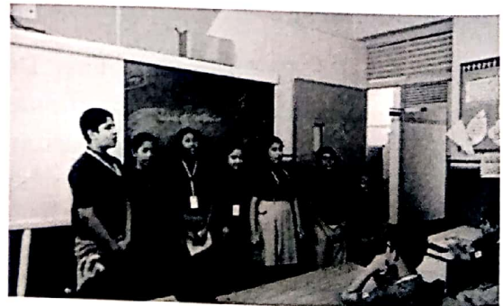
Sessions for awareness of mental health