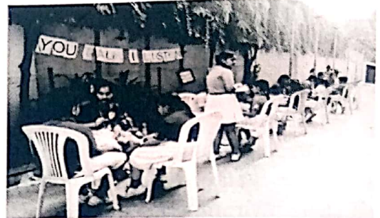
You talk I Listen to reach to problems of all