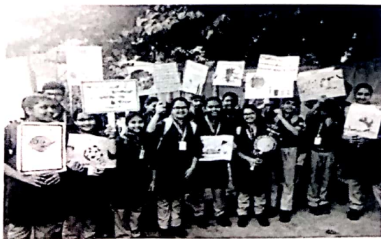
Campaign for climate change and waste segregation