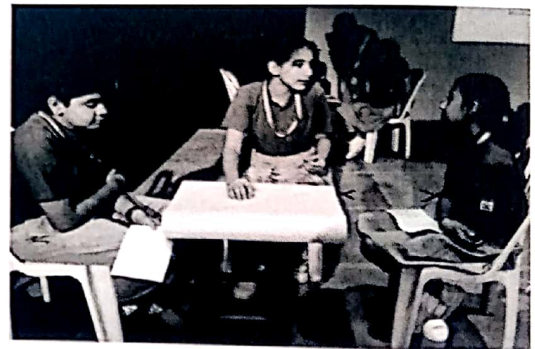
Peer mediation session to resolve the issues